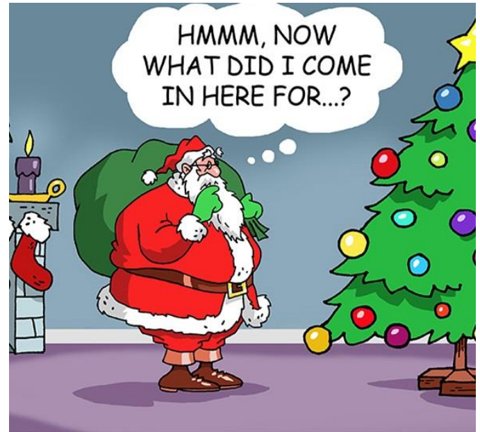
Santa has a senior moment